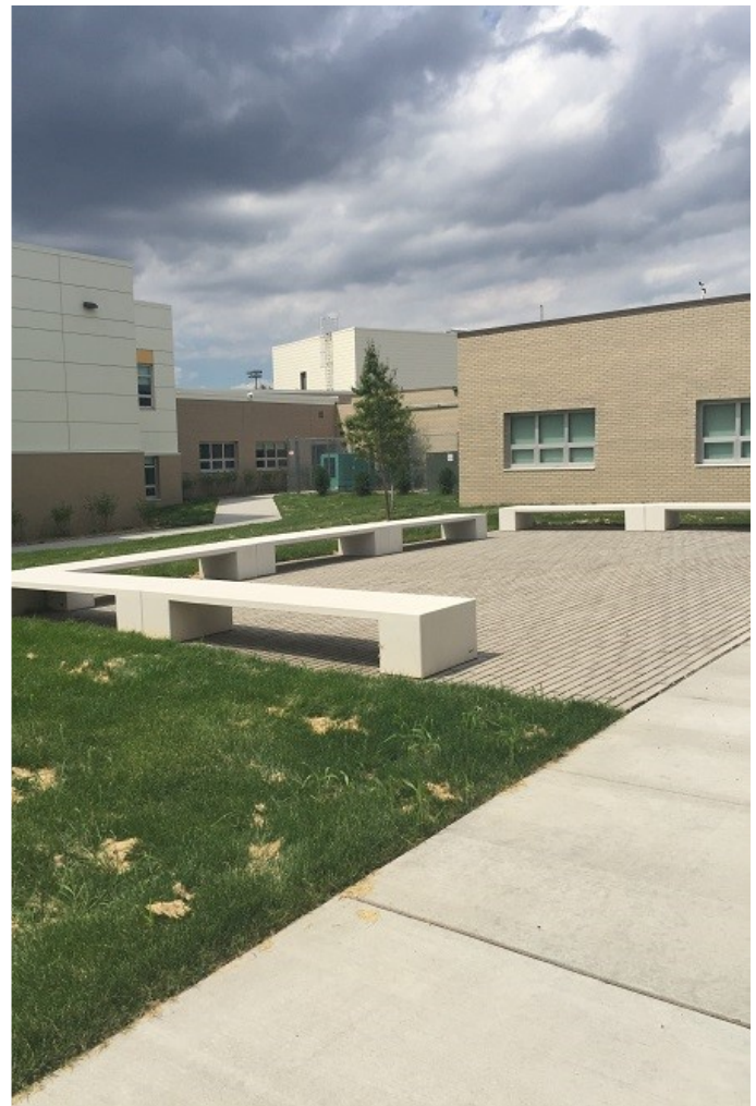
Images from left to right: View of the commons area looking east with cafeteria to the left; main entrance; accessible ramp that feeds both east entrances; rear courtyard outside of the art rooms. (July 2020)